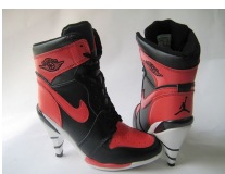
Air Jordan 13 Retro shoes black white ID:6061 Free Shipping